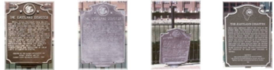
[Photos, from left: June 4, 1989 dedication ; 1999; April 2000; July 2003]