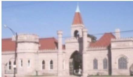
(Bohemian National Cemetery front gate.)

Join the Friends of Bohemian National Cemetery organization on May 1st for a walking tour of Bohemian National Cemetery, 5255 N. Pulaski Road, Chicago. Tours are 10-12 noon as well as 1-3 p.m.