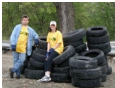
(Tire pile from River Cleanup Day 2003.)

Volunteers work at a site of their choosing from 9 a.m. to 12 noon. Afterwards, all volunteers are invited to attend the Chicago River Day Festival and picnic to celebrate all their hard work. Festival activities will include live music, live animals, a free barbecue for volunteers, canoe rides, and educational booths including one by EDHS. Come make a difference in the morning, and then visit us at the afternoon festival.