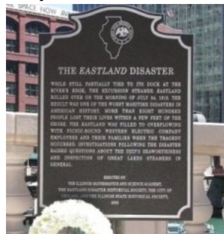
(Marker from 2003 anniversary event.)

Circle and reserve Saturday, July 24, 2004 on your calendars today - details will be communicated in a subsequent announcement.