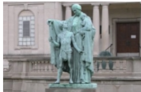
(Monument to "Mother" at Bohemian National.)