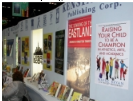
( THE SINKING OF THE EASTLAND was showcased with an oversized, well-lit display.)

BEA is the premier event serving the U.S. book publishing industry with more than 2,000 exhibits, 500 authors, and over 100 conference sessions. THE SINKING OF THE EASTLAND: America's Forgotten Tragedy is one of the lead titles this fall for Kensington Publishing, and visibility for the book was quite good.