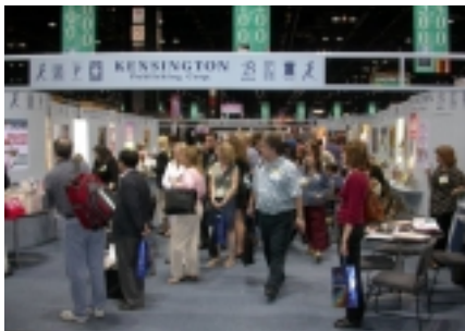
(Thousands of people walked through the Kensington Publishing area at McCormick Place.)