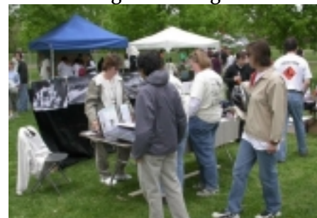
(Many volunteers stopped at the EDHS booth and learned about the Eastland Disaster.)

EDHS sponsored a booth at the Chicago River Day Festival held Saturday, May 8. The weather was perfect for the 3,000 volunteers who worked throughout the morning helping to clean up over 50 sites along the Chicago River.