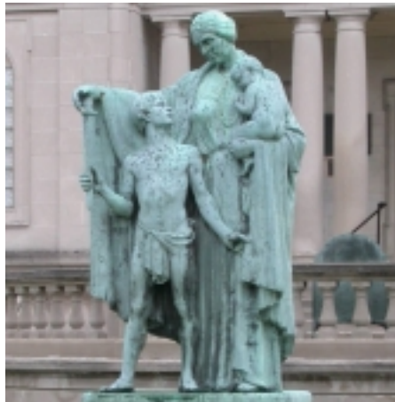
(Statue dedicated to motherhood.)

The tour begins at 1:00 p.m. with Albert Walavich's presentation in the large domed chapel. Smaller groups, guided by docents, will then tour the columbarium sections where intricately carved urns rest in individual niches. Encased behind glass doors, each niche also displays momentos and decorations chosen and changed by each respective family. The artistic merit of the urns is recognized by the Art Institute of Chicago which sends students to sketch them. Refreshments will be served in the Gatehouse after the tours.