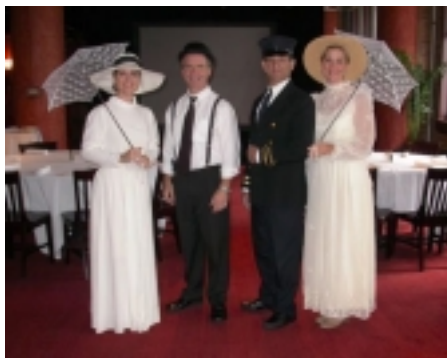
( Eastland Disaster cast at the Corporate Program for the World Presidents' Organization, July 17, 2004.)

Our Eastland Disaster Corporate Program makes a great venue for sharing the story of the Eastland Disaster with nearly any number of guests - from as few as eight or ten up to as many as several hundred. If you are planning a party, dinner, or an office event and you need a unique and powerful form of entertainment, please give us a call. We'll gladly discuss the options for how the Eastland Disaster can be a part of your day or evening.