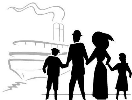
Eastland Disaster Historical Society

Since our inception, EDHS has made family history our top priority. Our perspective has always been (and always will be) that the Eastland Disaster is not simply a story about a ship tragedy, but rather that it is a compilation of thousands of personal stories, with each story as compelling and full of human interest as the next. Our corporate logo (above) was developed around this premise: Upon inspection, you will notice that the sketch of the Eastland is muted and in the background, while the family is highlighted and in the foreground.