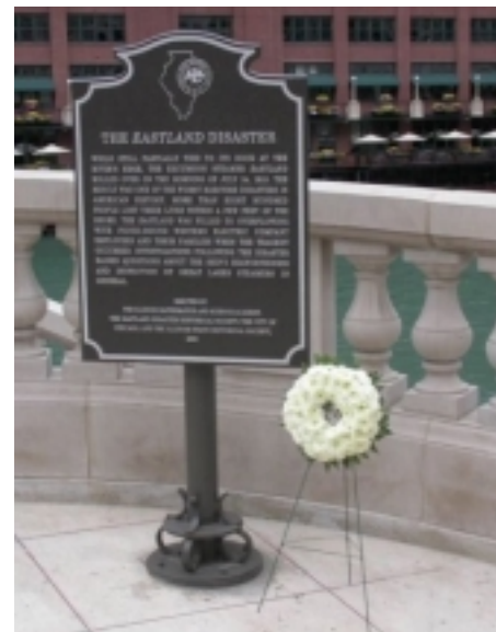
(Flower wreath donated by O'Brien the Florist, Elk Grove Village, Illinois.)

Saturday, July 24, 2004 marked 89 years (to the day) since the 5th annual Western Electric Hawthorne Works employee picnic turned tragic. A respectful ceremony and program commemorated the anniversary at the site of the tragedy.