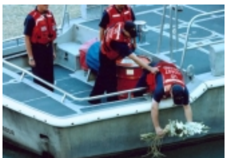
(U.S. Coast Guard laying memorial flowers in river at the site of the Eastland Disaster.)