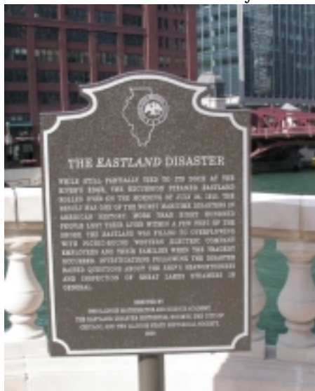
(The new marker at LaSalle and Wacker.)