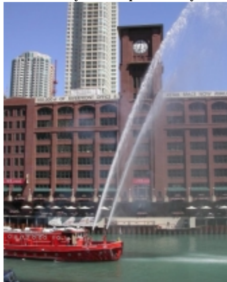
(Chicago Fire Department water display.)