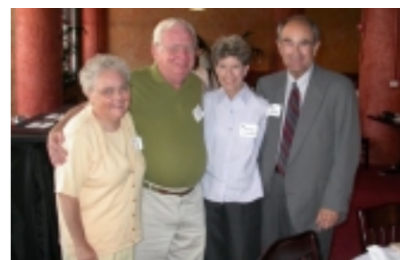
(Guests enjoying the luncheon/program at Bob Chinn's of Chicago.)